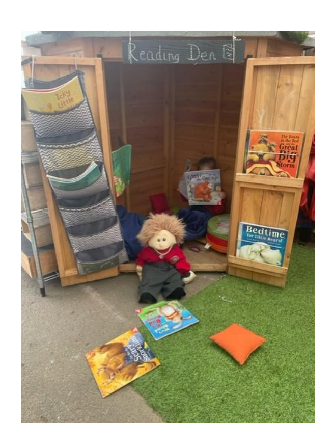
Here is Eric exploring your outdoor learning area.